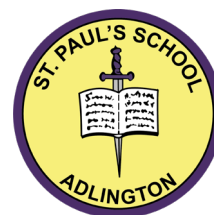
Adlington St. Paul's Church of England Primary School